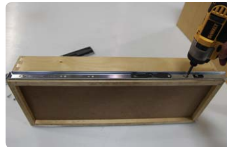
Locate the small drawer box slide, and using two smaller screws, fasten it to the drawer box as shown.