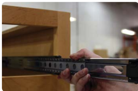
Check that the slide is both level, and parallel to the cabinet. Mark the back of the cabinet, and drill 2 10mm diameter holes for the bracket.