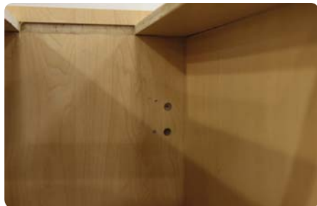
Remove all old slide hardware including all brackets and screws.