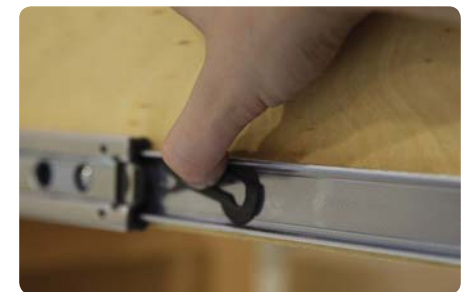
Repeat for the other side and any additional drawers. Line the slides up and push into the cabinet. To remove, push/pull the release clip.