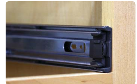
Place the slide on the frame of the cabinet, and push the slide into the bracket until the front of the slide is flush with the outside of the frame.