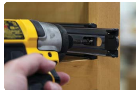
Attach the final screw through the frame. Tip: Pull the slide forward slightly to expose the hole.