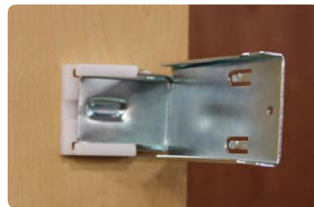
Place the mounting bracket into the newly drilled 10mm holes, and then place the large drawer box slide into the mounting bracket.