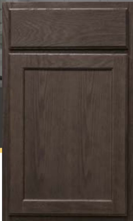
SHOWN IN SLATE

Choose your next kitchen or bathroom look at smartcabinetry.com/browse.php