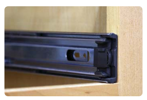
Place the slide on the frame of the cabinet, and push the slide into the bracket until the front of the slide is flush with the outside of the frame.