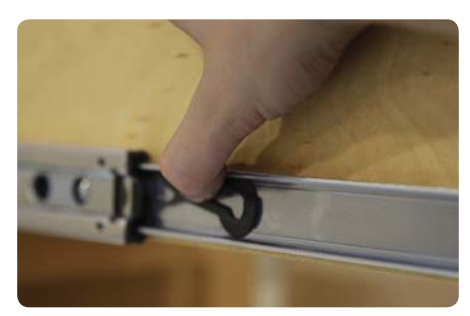
Repeat for the other side and any additional drawers. Line the slides up and push into the cabinet. To remove, push/pull the release clip.