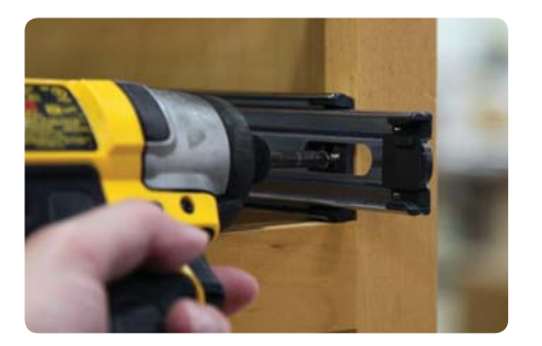
Attach the final screw through the frame. Tip: Pull the slide forward slightly to expose the hole.