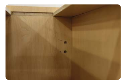
Remove all old slide hardware including all brackets and screws.