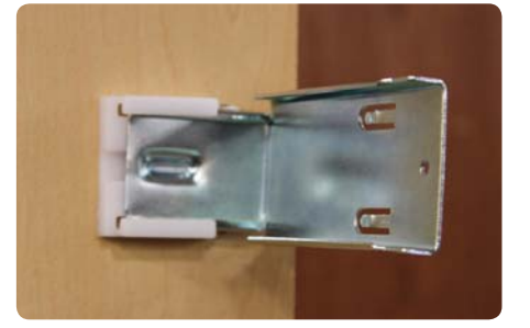
Place the mounting bracket into the newly drilled 10mm holes, and then place the large drawer box slide into the mounting bracket.