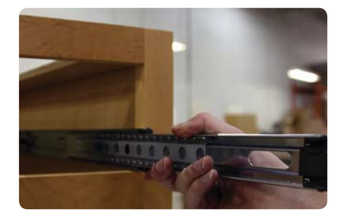
Check that the slide is both level, and parallel to the cabinet. Mark the back of the cabinet, and drill 2 10mm diameter holes for the bracket.