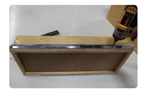
Locate the small drawer box slide, and using two smaller screws, fasten it to the drawer box as shown.